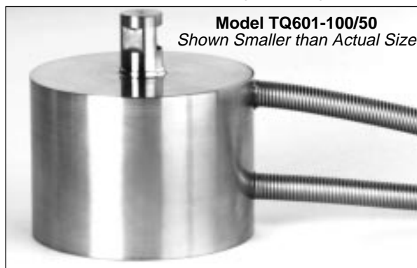
Model TQ601-100/50 Shown Smaller than Actual Size